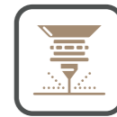
Welding & Joining