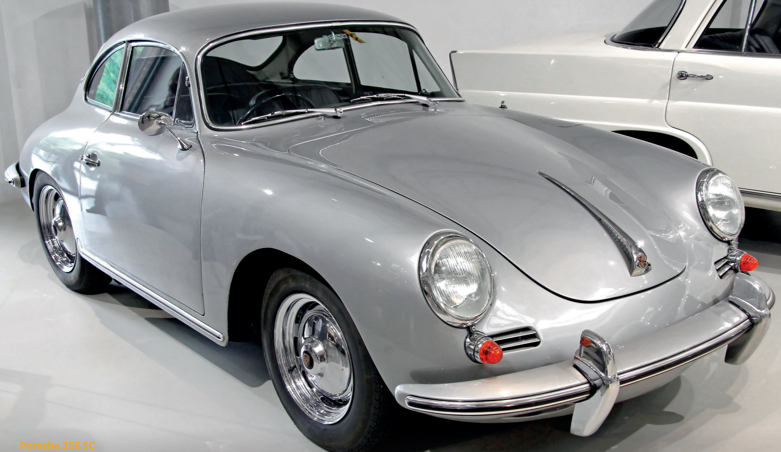
Porsche 356 SC

The Porsche 356 is the first production model from Porsche. The type designation 356 for the sports car is the serial number of this Porsche design.