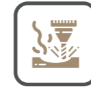
Milling & Die Casting

Depending on whether the requirements are for simple mechanical, complex or electronic components, we select the most suitable manufacturing technologies and materials for the relevant product. This variety of technologies for limited production and the production of individual parts is unique worldwide, and we are now using it for the production of prototypes, samples, replacement or limited production parts for classic vehicles.